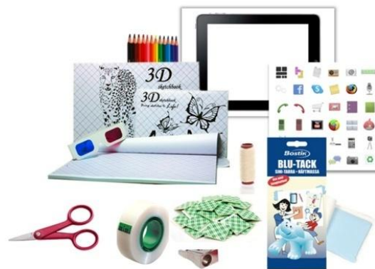
Hobby craft materials