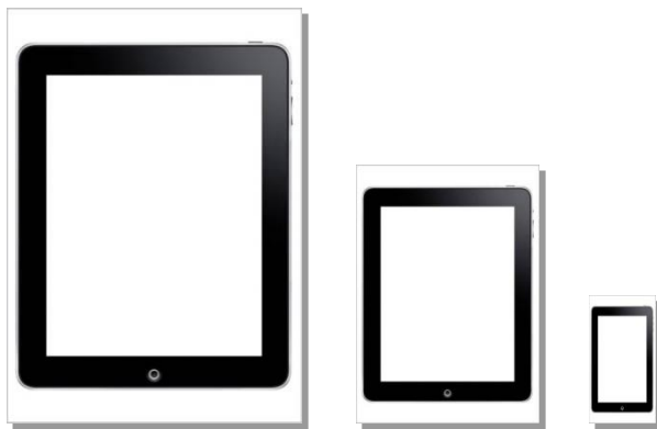
Paper Templates (10, 7, 4 inches)